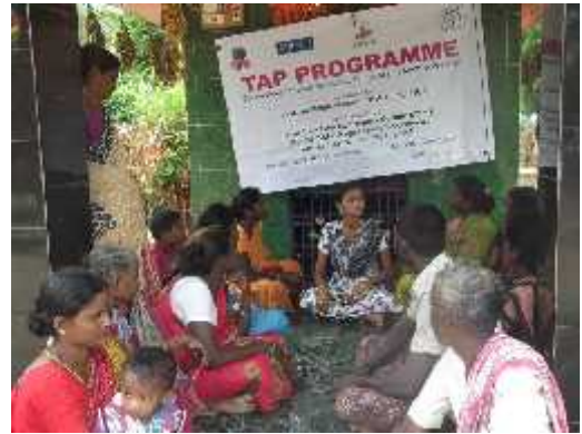
Adult Support Group meeting at Ramalayam, Jangalapalli on 10-10-2012

TAP staff motivated adults to form support groups. Till today 6 Adult Support Groups were formed 5 at Venkatagiri and 1 at Pellakur mandal. During monthly meetings explaining about the symptoms of TB and HIV, social responsibility of group members and also how to refer the suspected persons to the testing centre.