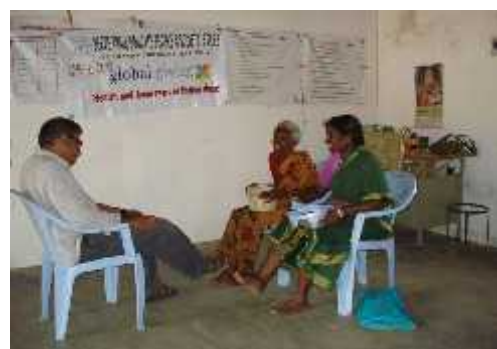
LF Patients with Drugs and doing Exercises