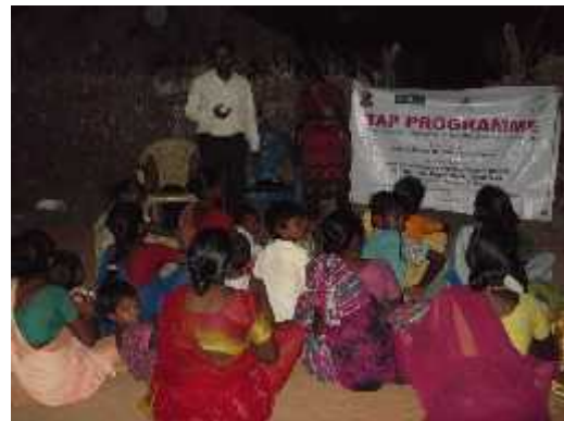
Awareness meeting about TB, HIV & Co-infection

Conducted 12 Mass Events at their target areas during this year. During these Events explained about TB, HIV & Co-Infection. Political Leaders, Teachers, Community People, SHG Leaders and Members have participated in this Events.