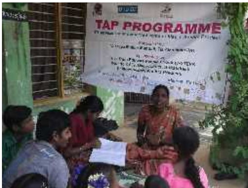
Children Support Group meeting at Z.P.High School, Sirasanambedu on 08-10-2012

2 Children Support Groups were formed, 1 Support group at Venkatagiri and 1 group at Pellakur mandal. Conducted monthly meetings regularly. In this meeting they were explained about the symptoms of TB and HIV, the social responsibility of group members and also explained about how to refer the suspect persons to the testing centre.